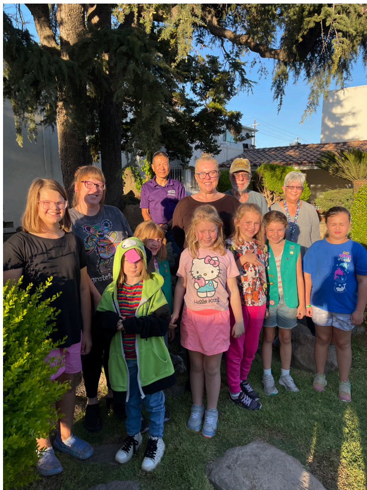
Girl Scout Troop 94

If you wish to stop by the church, please do so during those hours. Please contact the church at 530-743-6426 and let us know what day and time you would like to stop by. Please park on the 2nd street side of the church and enter through the Social Room door.